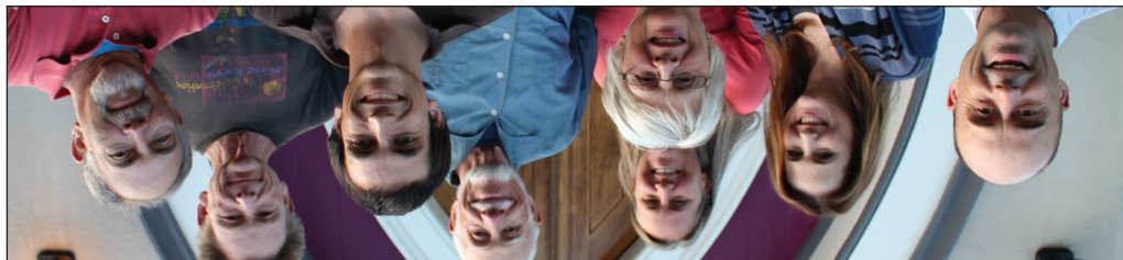
Members of the St. Paul's Vestry, Our Board of Directors