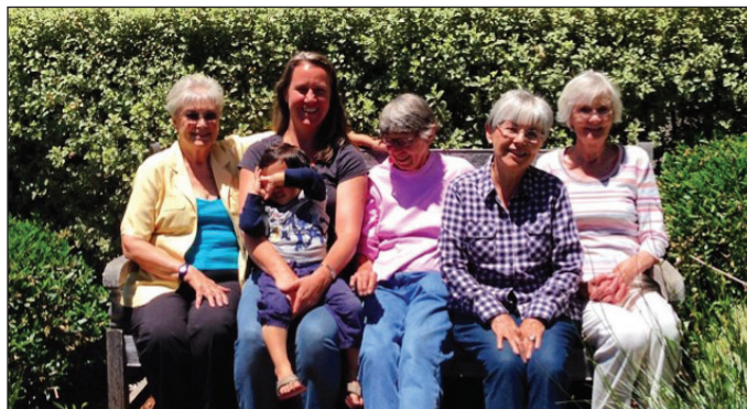
Some Active Members of St. Anne's Guild

Now, there are a lot more great experiences that St. Paul's has provided when it comes to hospitality and if I could, I would go on and on. But for now I will keep it short and sweet. Thank You St. Paul's For all that you have done for Young Moms Marin and me. ☀