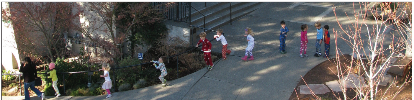
Pajama Day at Marin Day School

Lately we are aware of the singing of morning prayer in the chapel where Grace Marin convenes. Feeling the intention all around us grounds and strengthens our prayer. Thursday mornings are a rich time at St. Paul's where so many are welcomed and at home, reaching for the sacred in our diverse ways. ☀