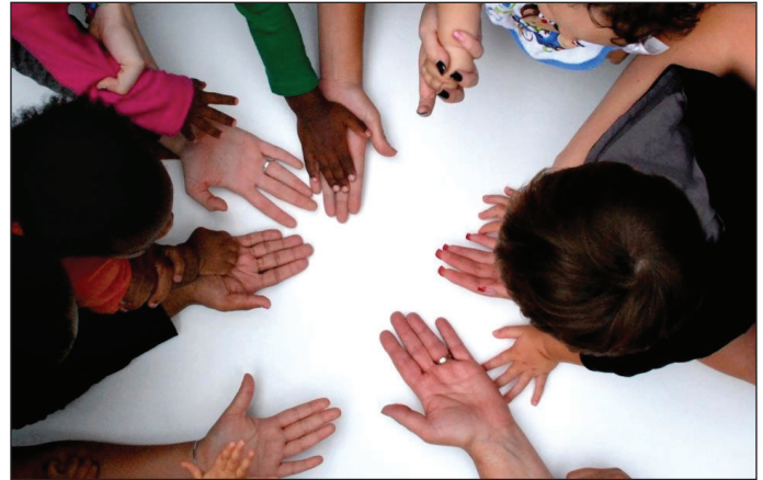
The Hands of Young Moms Marin

Not only are members from the St. Pauls' church friendly and generous with their time but they also don't hesitate when it comes to inviting the group to events, one of