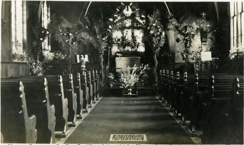
Easter flowers at St. Paul's Church in 1913.