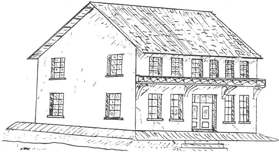
The Marin County Courthouse in 1868