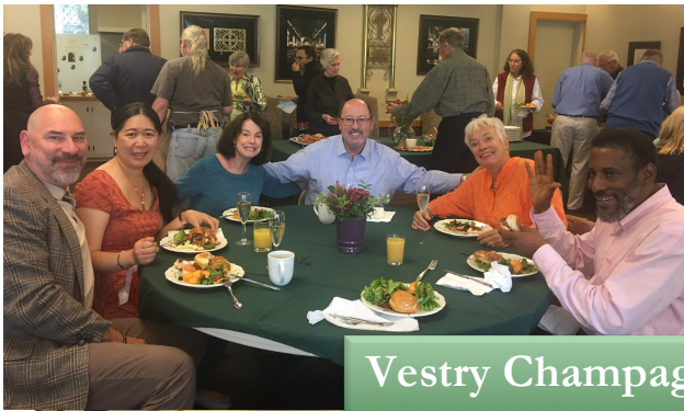
Vestry Champagne Brunch