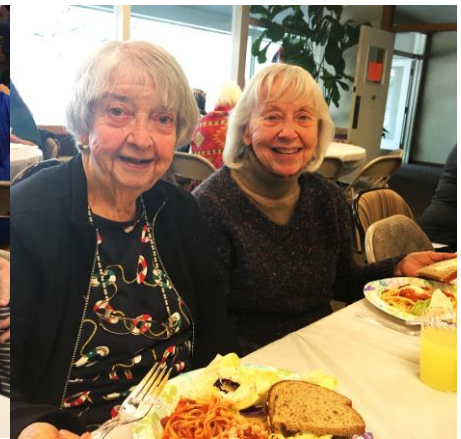
Girl Scout Spaghetti Dinner to benefit the Downtown Streets Team